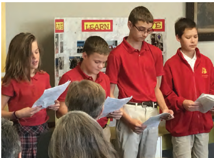
St. Benedict students perform The Betsy Ross Story